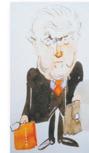
Greene , by Paul Hogarth

In The Third Man, Graham Greene lampooned earnest literary gatherings by sending a writer of cheap novelettes to answer questions on James Joyce and the stream of consciousness. He might forgive us for organising a literary festival in his honour, an event now in its eighteenth year. People from all over the world will again descend on Berkhamsted to celebrate his life and works – many of them seasoned Greene Festival-goers, some first-time visitors. All are welcome, and all assured of a varied and interesting programme. There may be some earnestness, but there will certainly be friendliness and laughter. I hope you will come along.