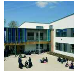
St John's School