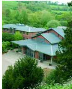
Ellis Theatre Marlborough College