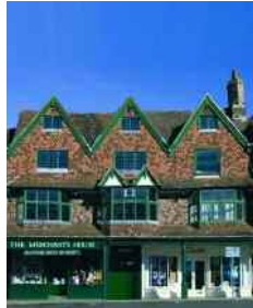
The Merchant's House