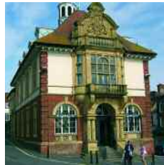
The Town Hall